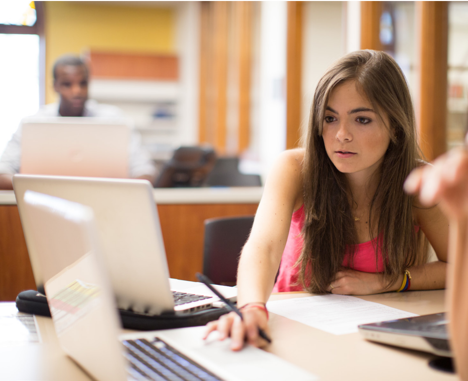
▶ The Rollins Help Desk is the first point of contact for all technology issues at the College.