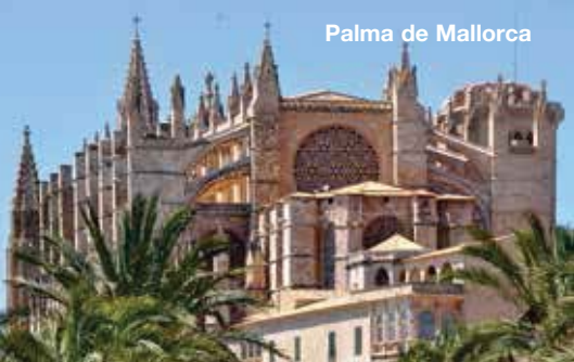
Palma de Mallorca