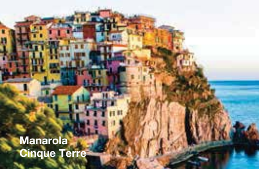
Manarola Cinque Terre