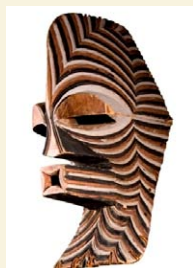
Songe (face mask in Kifwebe style), Zaire Wood, cord, beads, polychrome