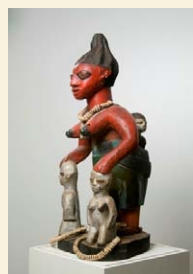
Yoruba (female figure with three children), Nigeria Wood, oil base paint, cowries