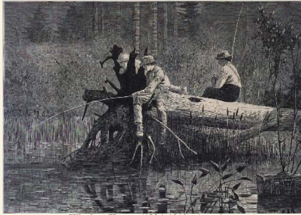
Winslow Homer (1836-1910), American 'Waiting for a Bite', Harper's Weekly, August 22, 1874 Wood engraving on newsprint, 13¼ x 20½ inches Collection of the Cornell Fine Arts Museum at Rollins College

greatest artists. Classic Homer prints such as the charming "Waiting for a Bite" will be included in the exhibition