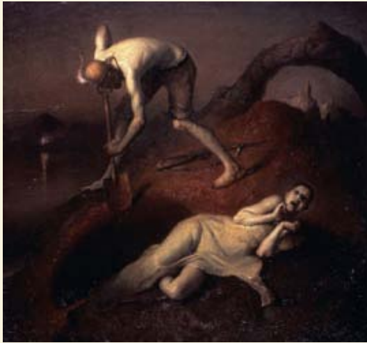
Odd Nerdrum (b.