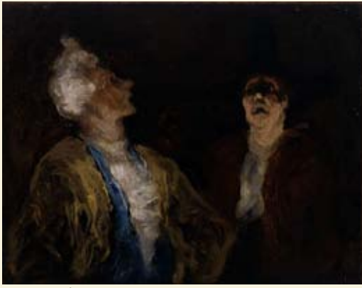
Honoré Daumier (1808-1879), French Scène de comédie (Two Actors) , 1870-1873 Oil on canvas, mounted on panel, 9 3/8 x 12 1/2 inches Lent by the UCLA Hammer Museum