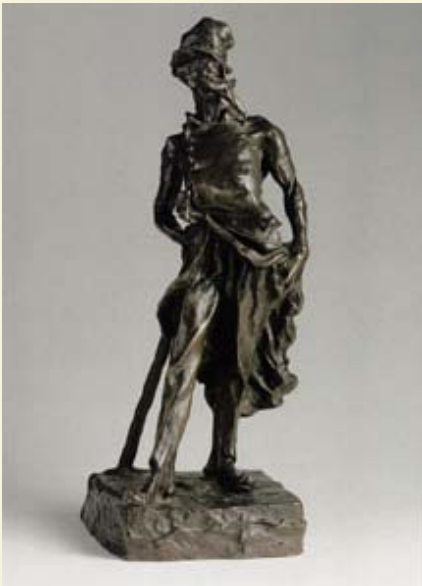
Honoré Daumier (1808-1879), French Ratapoil , 1891 (Modeled in clay 1851) cast in bronze, No. 0 17 1/2 inches high Lent by the UCLA Hammer Museum