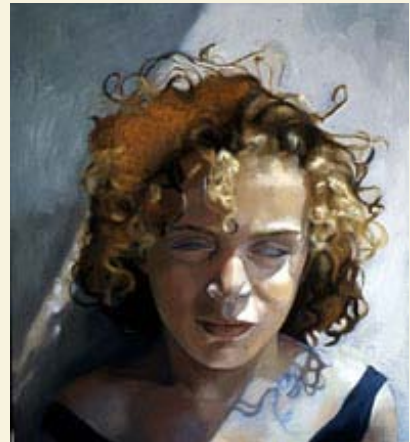
Rima Jabbur (b. 1954), American Maya , 1999